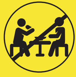
Avoid eating face to face and sharing food