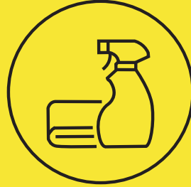
Keep surfaces clean